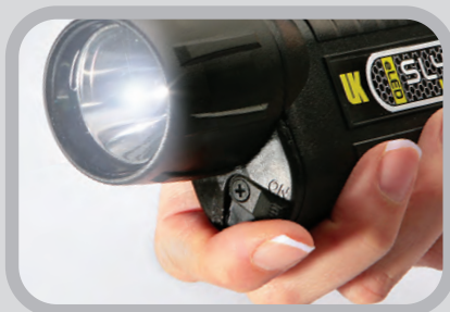
One-handed switch operation